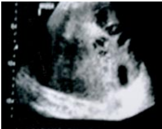
Figure 3. Ultrasound features of the large and complex left adnexal tumour.

Additionally, ultrasound study of the mass showed classic malignant features, images of metastases were found in the liver parenchyma, and CA-125 determination was very elevated. The tumour sample features disclosed primary undifferentiated ovarian cancer, while yellow nail syndrome could be characterised by clinical and imaging data. The patient did not show any improvement in spite of the clinical care and the nutritional support. She developed irreversible respiratory and renal failure and died 12 days after the admission.