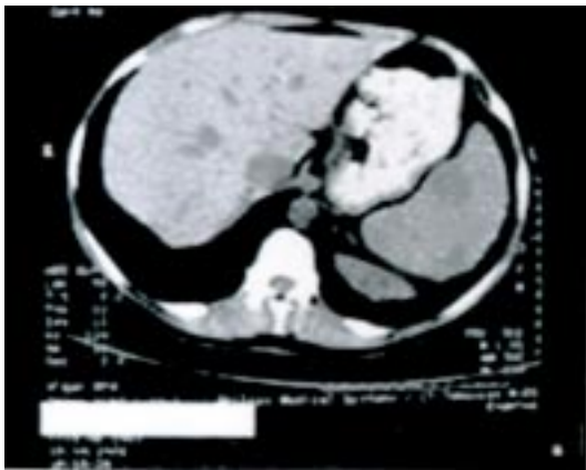
Figure 2. Computerised tomography of the scattered nodules in the liver parenchyma.