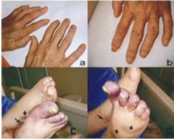
Figure 1. Yellow nail discoloration and absence of lunules in the hand fingers (a and b), in addition to dystrophic yellow nails and pitting oedema (arrows) in both lower limbs (c and d).

nodules in the liver parenchyma (Figure 2). Pelvic ultrasound showed a mass (20.7 cm x 15.8 cm x 14.7 cm) with a solid and cystic complex internal structure (Figure 3). The lymphoscintigraphy disclosed inguinal and intrapelvic lymph stasis after 24 hours (Figure 4).