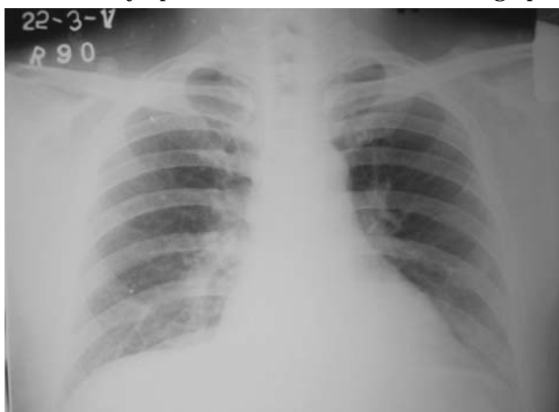
Figure 3. Chest radiograph (postero-anterior view) reported to be normal. This was obtained 3.4 years after the diagnosis of sarcoidosis when the patient was diagnosed to have smear positive TB lymphadenitis.

limits (Figure 3). Thereafter, the patient was treated with thrice-weekly intermittent treatment Category I DOTS under the Revised National Tuberculosis Control Programme (RNTCP). The patient showed clinical improvement and the lymph node regressed completely. At one-year of follow-up, the patient remained asymptomatic with normal chest radiograph.