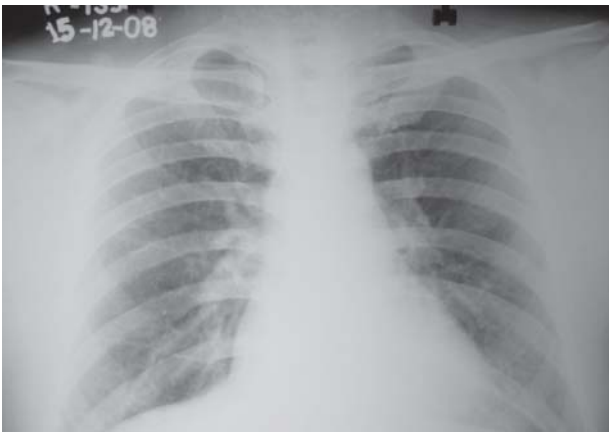
Figure 1. Chest radiograph (postero-anterior view) reported to be normal. This was obtained at the time the patient was diagnosed to have sarcoidosis based on excision biopsy of the cervical lymph node.

either be TB or sarcoidosis. The patient was advised to undergo a repeat FNAC examination of the cervical lymph node. The repeat FNAC showed polymorphic population of lymphoid cells in varying stages of maturation and no evidence of granulomatous inflammation suggestive of reactive lymphoid hyperplasia. The patient was treated with a course of antibiotics and was kept under a regular follow-up.