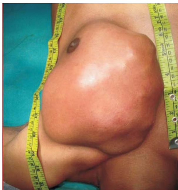
Figure 1. Clinical photograph showing a tumour in the anterior chest wall.

A 35-year-old male patient presented with a slow-growing mass in front of his left chest wall for the last 10 years. The mass had an irregular surface and ill-defined margins. It was measuring 20cmx15cm, was hard and fixed to the anterior left chest wall (Figure 1). Chest radiograph showed a soft tissue shadow on the left chest wall. Contrast enhanced computed tomography (CECT) of the chest revealed a large heterogeneous lobulated mass on the left