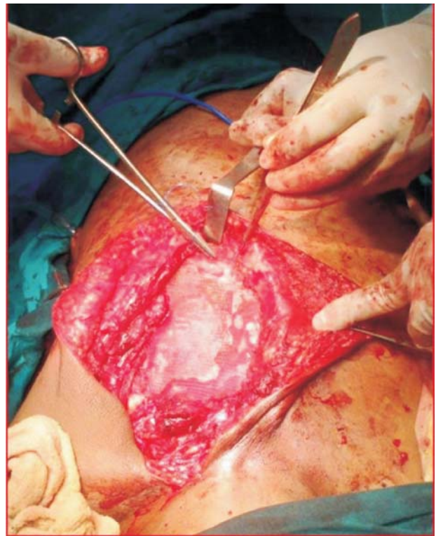
Figure 4. Intra-operative photograph showing prolene mesh reconstruction of the chest wall.