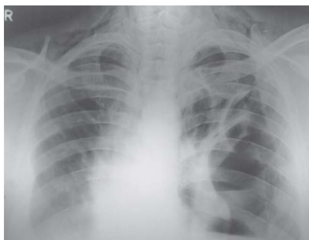
Figure 1. Chest radiograph (postero-anterior view) showing hydropneumothorax on the left side, pleural effusion on the right side and subcutaneous emphysema.

Broad-spectrum antibiotics were initiated and closed tube thoracostomy was performed on the left side. Subsequent chest radiograph showed expansion of left lung with drainage of effusion but an increase in pleural effusion on the right side. Radiograph barium swallow showed abnormal extravasation of the barium and passage of contrast into the pleural space